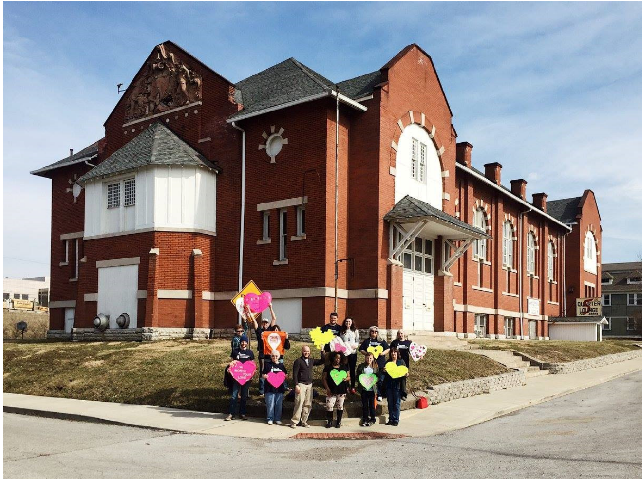
Neighbors stand with Indiana Landmarks to show their support of historic buildings in our neighborhood