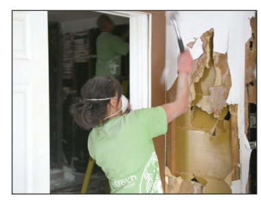
Dathouse Community Center