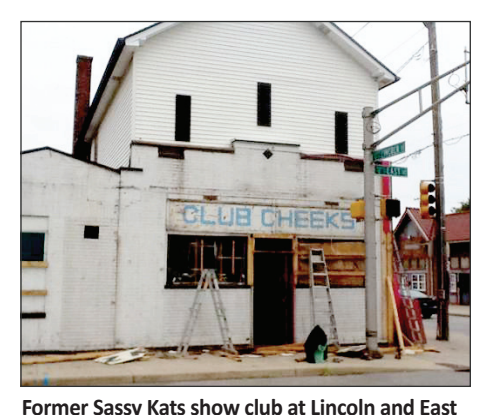
Streets. Pink façade was recently removed only to discover remnants of former show club.

Dathouse and its programs have always been run from one or more of our homes. We felt strong about starting a community center and having a place that would be a better home for our organization. To that end, we acquired the former Sassy Kats show club (thanks to those who helped shut it down) in February of this year and are currently in the remodeling process. We have many ideas for uses of the building. We will definitely use it for our youth hang-out times. We would like to have family fun nights and movie showings as well. We have a passion for early education and preschool-age kids learning opportunities. We are not sure of all the things we will initiate, but we want to offer the building to be used by others who want to initiate their ideas.