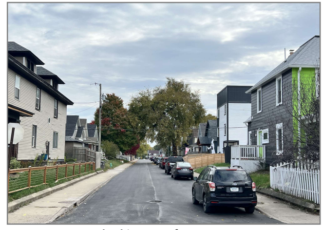
Cottage Avenue, looking east from East Street

We have many more streets and sidewalks to go! Please remember that these projects took years of requests and reminders to turn into reality. Please remember that the resources available to us are very limited, but they are there. Remember to keep asking the City and your City-County Councilor and the Neighborhood Association for help where you have infrastructure needs. Persistence pays off. Thank you!