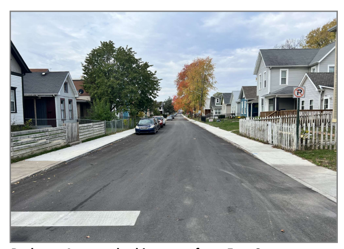
Parkway Avenue, looking west from East Street